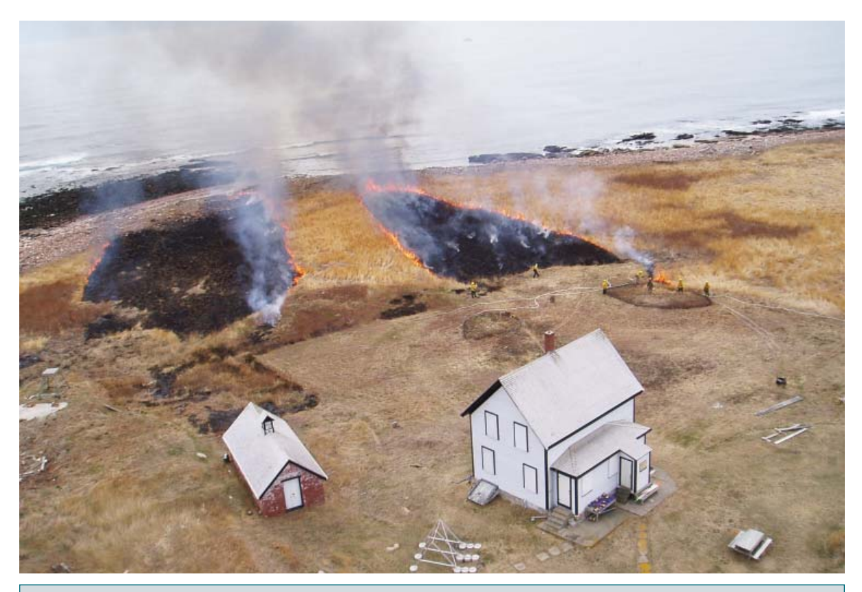
Firefighters ignite a prescribed fire near homes near the Petit Manann National Wildlife Refuge in Maine.

The National Cohesive Wildland Fire Management Strategy is an ongoing effort by federal, tribal, state and local governments and non-government organizations to address growing wildfire challenges in the United States.