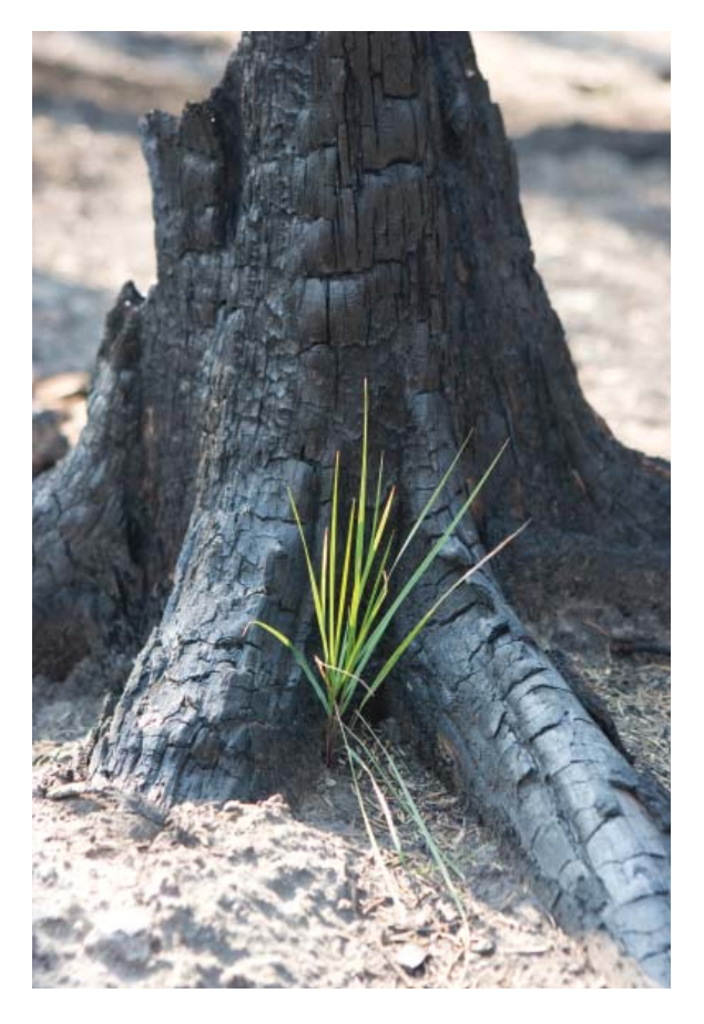
Regrowth on the Cascade Complex, Idaho, 2007.