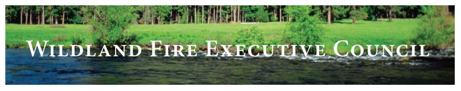
September 2, 2011

Subject: Cohesive Strategy Communication Workgroup (CS-CW)