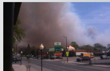
The Benefits of Fuels Treatment Program on the Seney National Wildlife Refuge, Michigan

On May 17, 2012, a wildfire was started by a downed power line that quickly threatened town of Ely, MN. Due to a coordinated response by Federal, State and local resources, residents were safely evacuated and shared aviation assets were quickly and efficiently dispatched to the fire. The collaborative efforts of the Minnesota Incident Command System partners contributed to the favorable outcome of the fire.