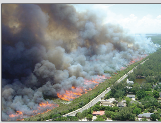
Wildland fire management decisions can be complicated by competing values and risks when human development occurs in fire-prone landscapes. The Cohesive Strategy takes a holistic approach to wildland fire management.

Science is an essential component of the Cohesive Strategy's holistic approach. In order to better integrate scientific understanding and rigor into the Cohesive Strategy, the National Science and Analysis Team (NSAT) was formed to support development and implementation of the Cohesive Strategy. Since 2010, more than sixty people representing numerous agencies and organizations have contributed to the NSAT's efforts. A smaller core group is responsible for the more data-intensive tasks and provides direct support to various other planning teams.