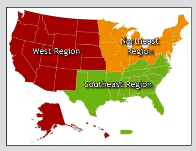
Regional strategy committees represent three US regions.

The Phase III work of the NSAT consists of two parts. The first part involves direct analytical support to the three regional strategy committees, representing the Western, Southeastern, and Northeastern regions. The NSAT summarized and analyzed data from a broad range of sources and disciplines and provided these analyses to each region to help them characterize risks unique to or shared across regions.