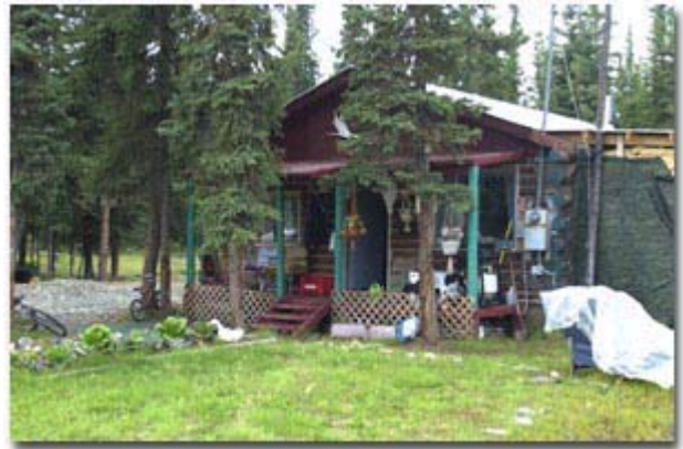
Dense stands of white spruce pose the threat of wildfire to the community of Tanacross

Planning is underway for similar projects in Northway and Nulato. The Alaska Fire Service has completed smaller fuels reduction projects in three areas on Fort Wainwright where spruce stands posed a risk to adjacent communities.