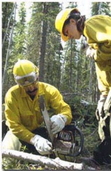
A two day course was held before