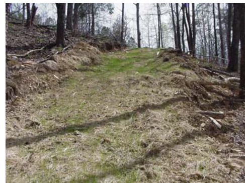
This fireline was mulched and seeded to minimize soil movement. Six weeks and six inches of rain (in a 24 hour period) later there was little soil movement.