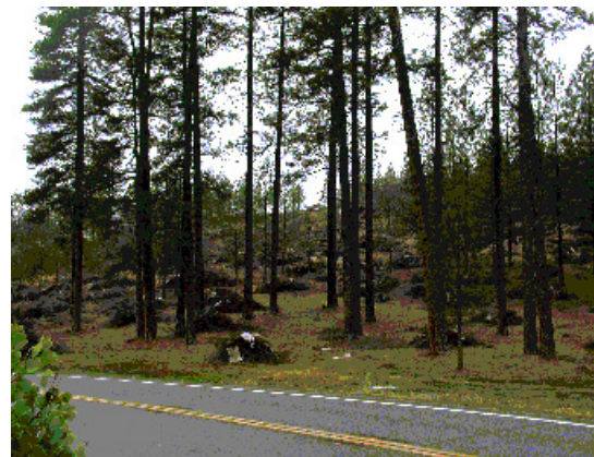
Figures 1 and 2. These pictures were taken prior to FMZ construction and after hand piling was completed and prior to pile burning.