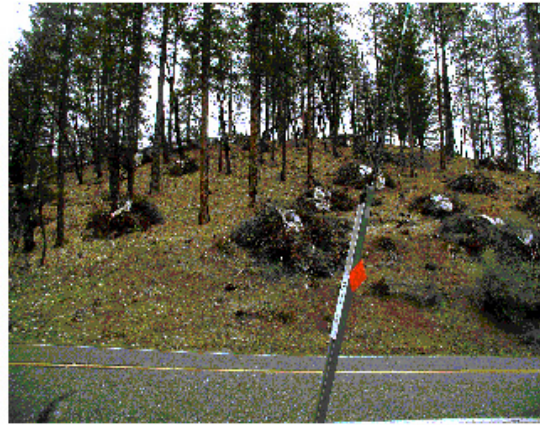
Figures 5 and 6. These pictures were taken prior to FMZ construction and after hand piling was completed and prior to pile burning.