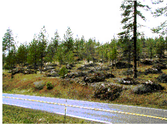
Figures 3 and 4. These pictures were taken prior to FMZ construction and after hand piling was completed and prior to pile burning.