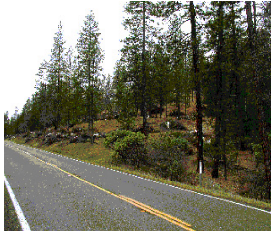
Figures 7 and 8. These pictures were taken prior to FMZ construction and after hand piling was completed and prior to pile burning.

Contact. Julie Thrupp Titus, Fuels Mgmt/Fire Prevention Officer. Phone number: (530) 926-9666/226-2393