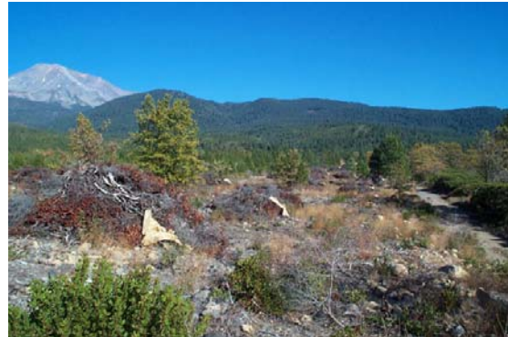
Figure 2. Project area site after piling fuels and prior to burning.

Accomplishments to date. Since 1995, approximately 2000 acres have been treated.