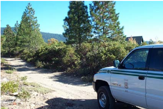
Figure 1. Project area site prior to implementation.

Implementation. An average of approximately 800 acres have been treated annually since 1995. There are 450 acres remaining within the project area that needs treatment. A portion of the treated areas received three layers of treatment to bring the site from a Condition Class III to a Condition Class I.