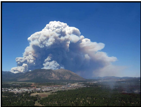
View of the 2010 Schultz Fire smoke column rising up behind Mt Elden.